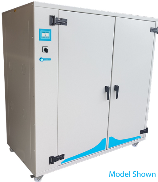
Model Shown - LCI/750H/TDIG