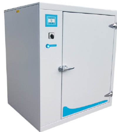
Model Shown - LCI/425V/TDIG

The Genlab range of Large Capacity Incubators offers a selection of highly efficient, reliable and cost effective units. They are suitable for larger applications of incubation, research and general laboratory applications. Featuring our latest touch screen control system which offers intuitive control and excellent accuracies designed for laboratory incubators.